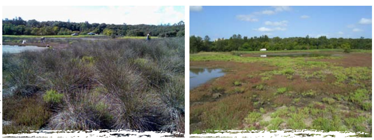
Before and after treatment for spiny rush at Sydney Olympic Park

Seasonal considerations are taken into account when treating spiny rush. Treatment is generally not undertaken between June and August, when spiny rush is not actively growing and sheltering fauna is less likely to be active and hence less able to move out of the area. Care is taken prior to treatment in warmer months to ensure that no birds are nesting in the area.