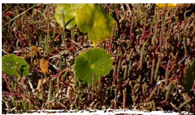
Pennywort growing in saltmarsh

plan describes the most successful methods in management and control of bitou bush and boneseed (DEC 2006).