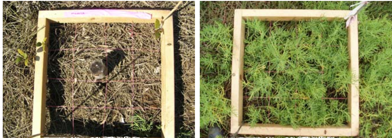
Saltmarsh regrowth after mangrove removal - the same plot at time of removal and 18 months later

The grey mangrove ( Avicennia marina ) is known to colonise saltmarsh habitats in NSW. Although mangroves diminish in height and vigour with elevation, their habitat range can overlap with that of saltmarsh for a substantial portion of the upper tidal range (up to 30 metres at Kooragang Island) (Nelson 2006). The factors driving mangrove encroachment on saltmarsh are still unclear. It is believed that mangrove incursion on